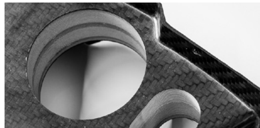
Machining processes compared: dry (left), rhenus special coolant (right)