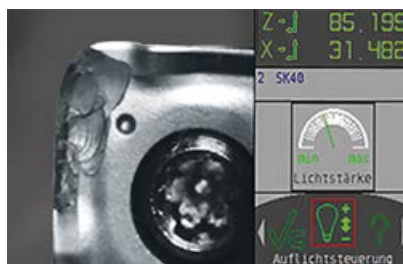
Cutting edge inspection – 12-fold magnification of the cutting edge in incident light for quality control (option)