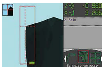
Dynamic crosshairs for automatic and fast measurement independent of the operator