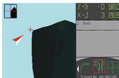
EZnavigator – compass needle for simple camera positioning to measure nominal values (option)