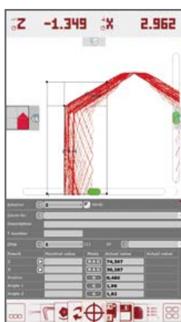
EZmax software function to determine and measure the maximum contour of the tool