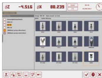
Graphics Management: The operator can assign a graphic from the integrated standard library to the tool or to the machine tool