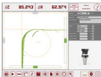
EZmax – Software function for determining and measuring the tool contour