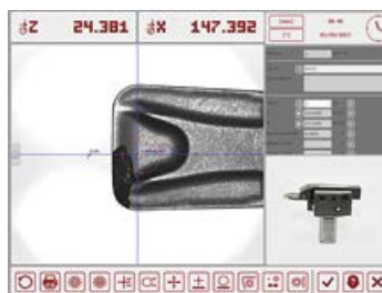
Cutting edge inspection – 28-fold magnification of the cutting edge in incident light for quality control